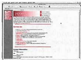
Stuttering Foundation of America's Web Page.

■ A teacher adds, "I just wanted to drop a quick note to tell you how much this web site has helped me. I am a second grade teacher and I have a student who stutters. I was not taught anything about this when I attended college for my BA in Education. Therefore, I am very grateful for the info. that has been provided on this web site. Thank you."