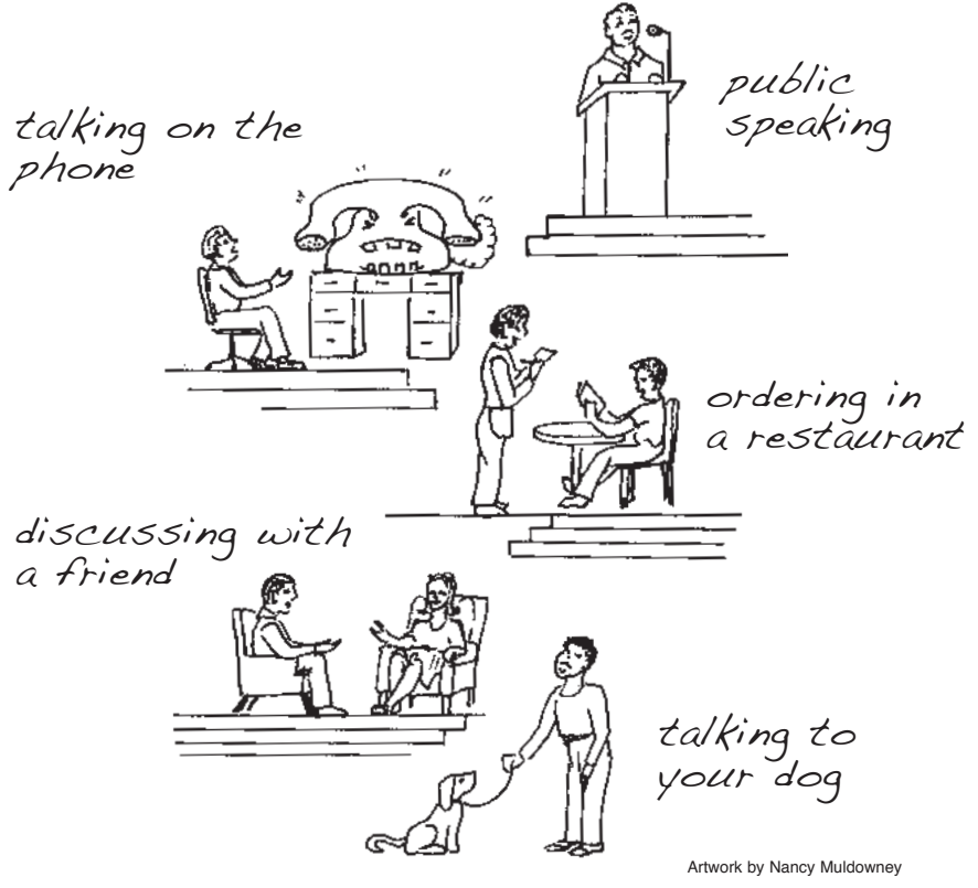
A hierarchy going from easier situations to harder ones.

You will need to develop your own hierarchy as the points listed here may not be right for you.